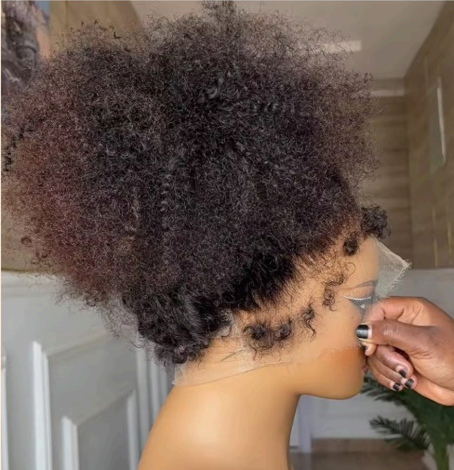
360 DEGREE WIG CAP