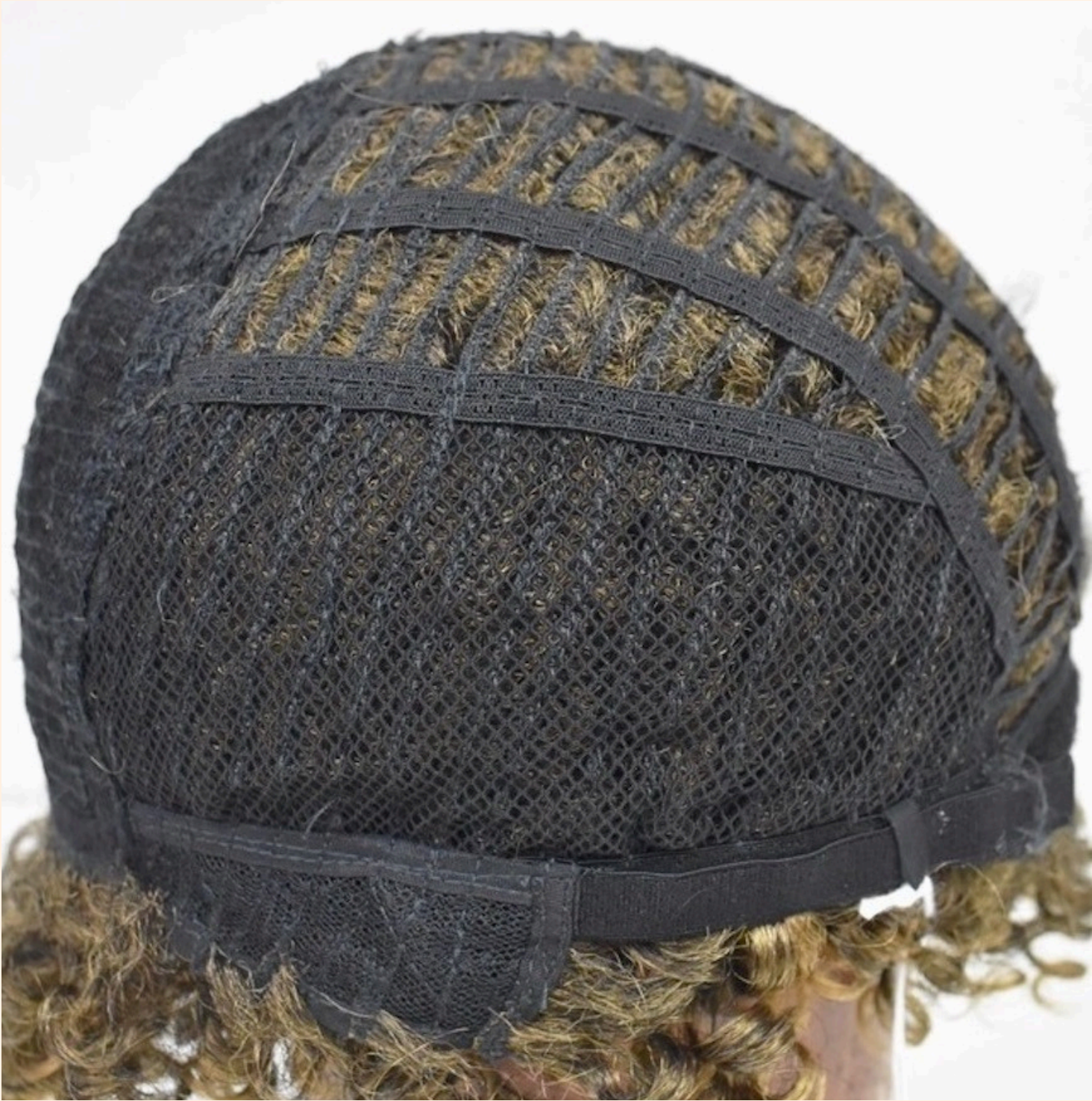
OPEN WIG CAP