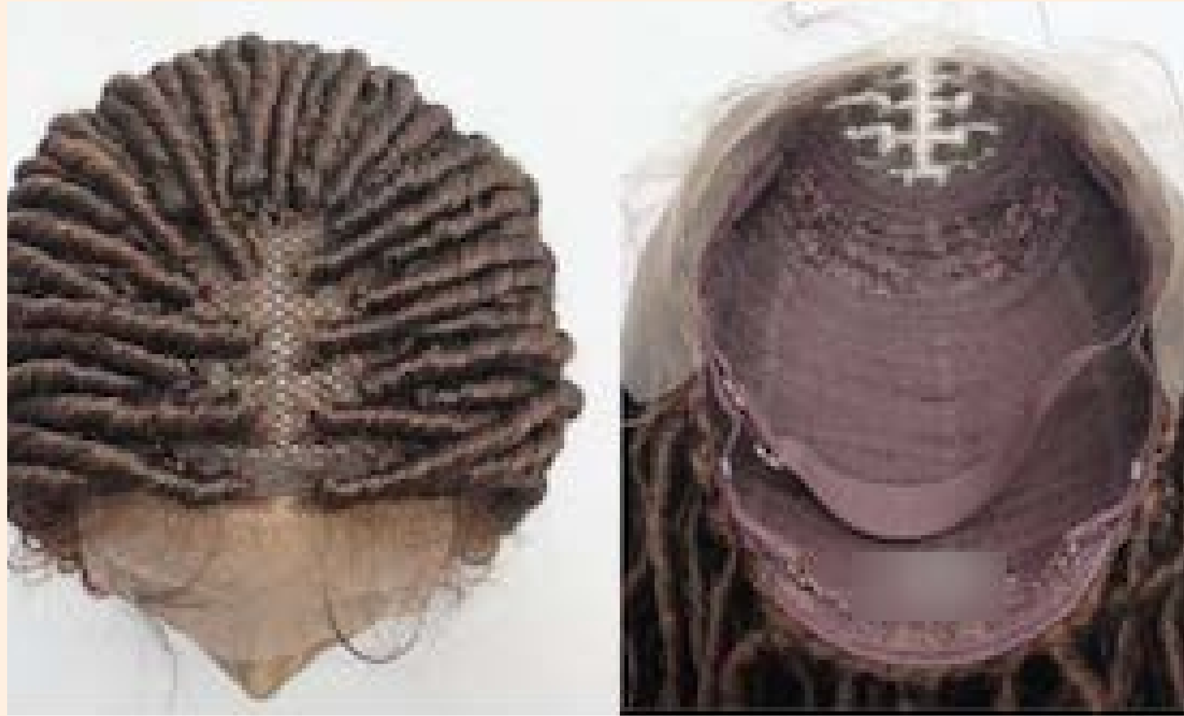
LACE TOP WITH LACE FRONT WIG CAP