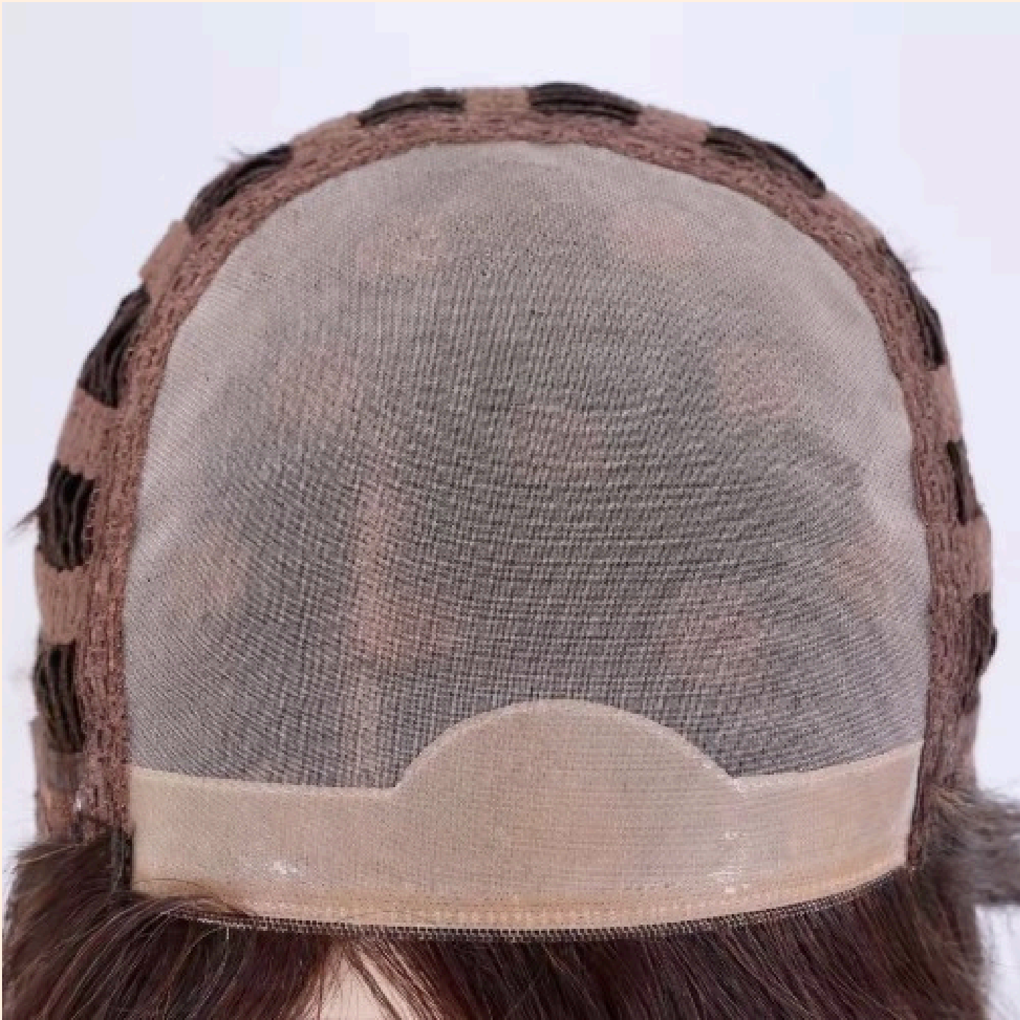
MONOFILAMENT WIG CAP