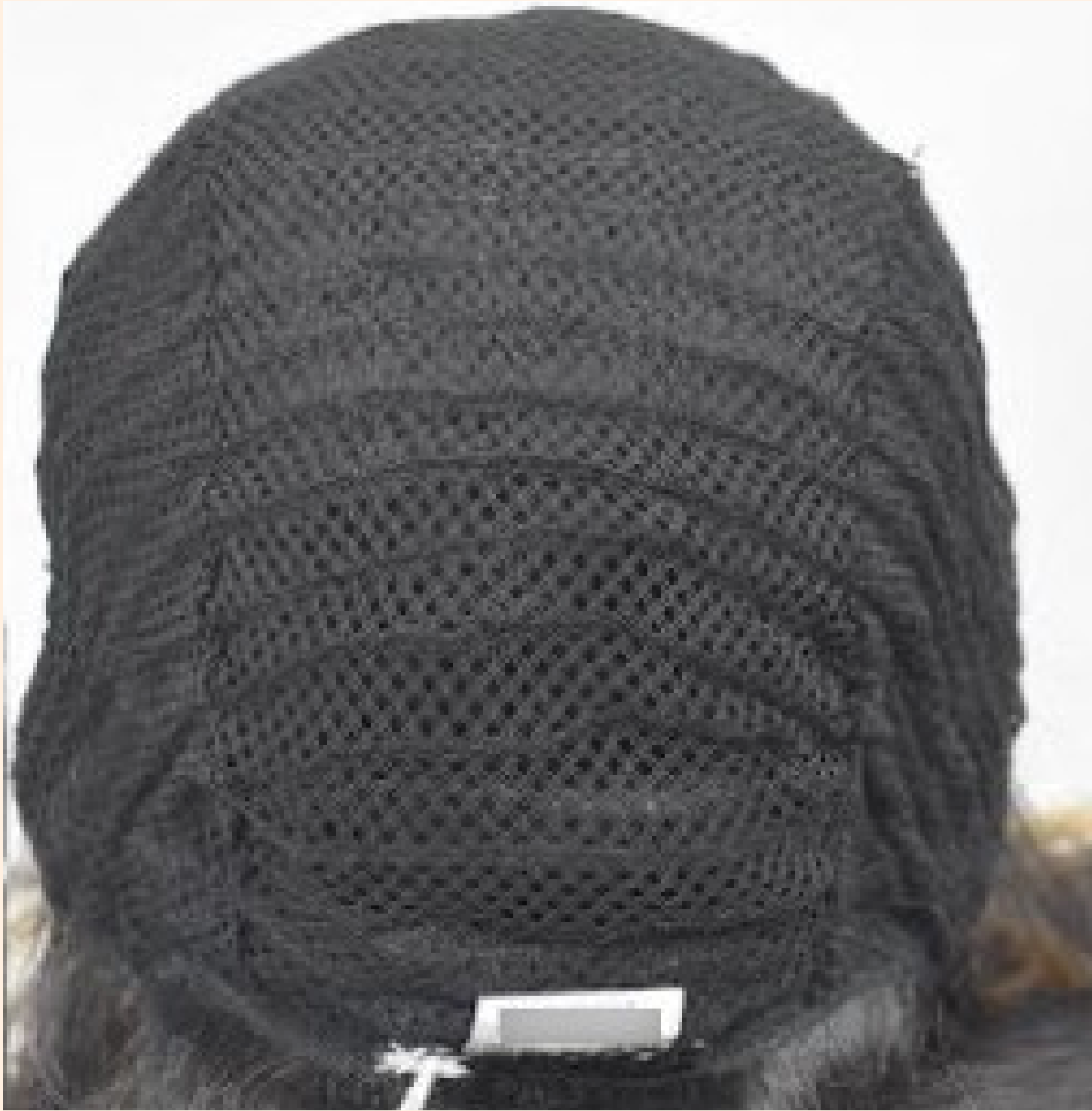
CLOSED WIG CAP