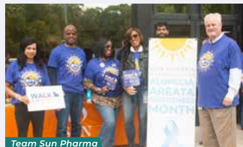
Team Sun Pharma