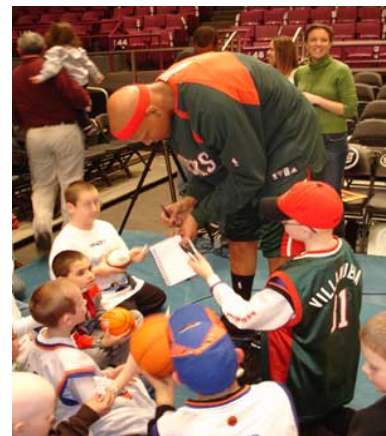
NAAF Spokesperson Charlie Villanueva of the Detroit Pistons, NBA